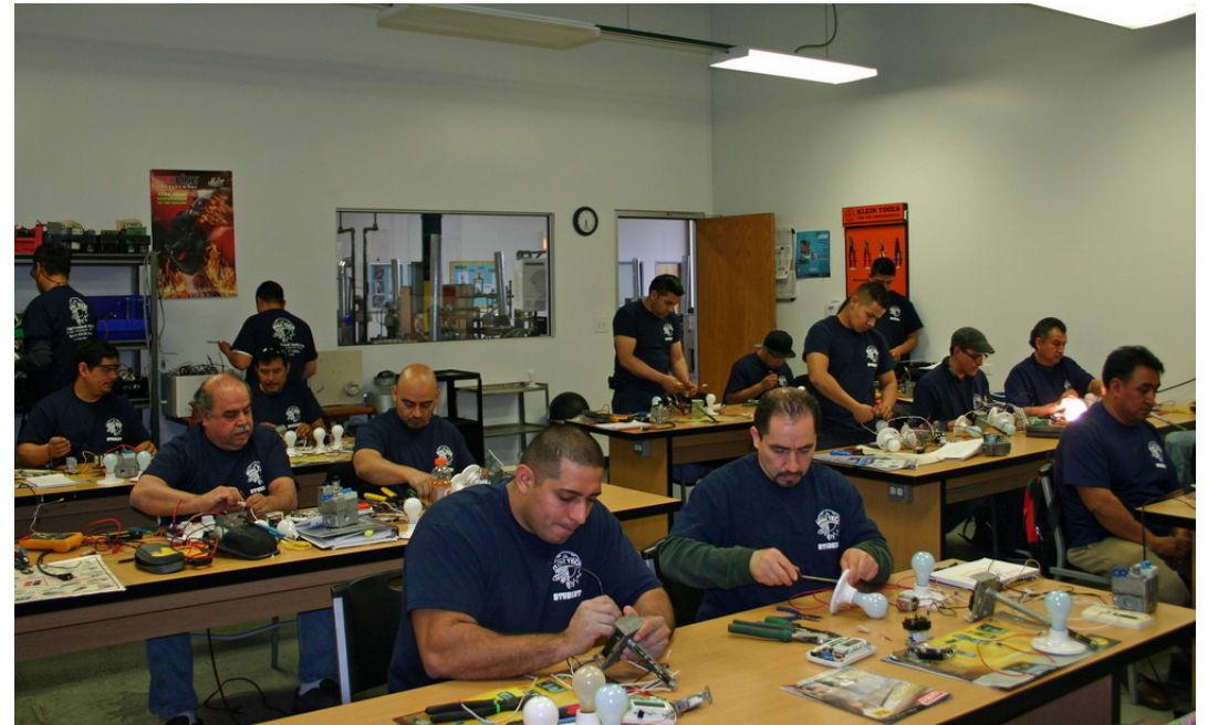
In the Classroom